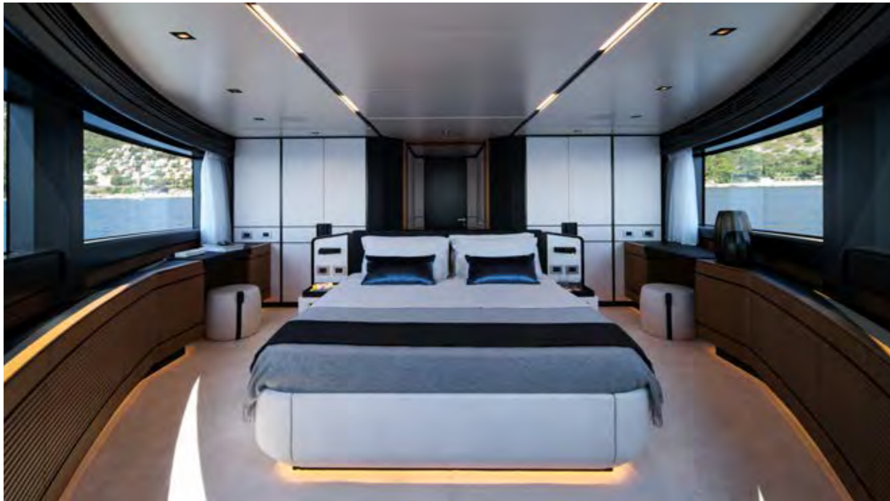
The master suite features two large separate bathrooms and stands out also for its exceptionally low noise level thanks to the positioning of the engine room aft, at the opposite side of the boat.