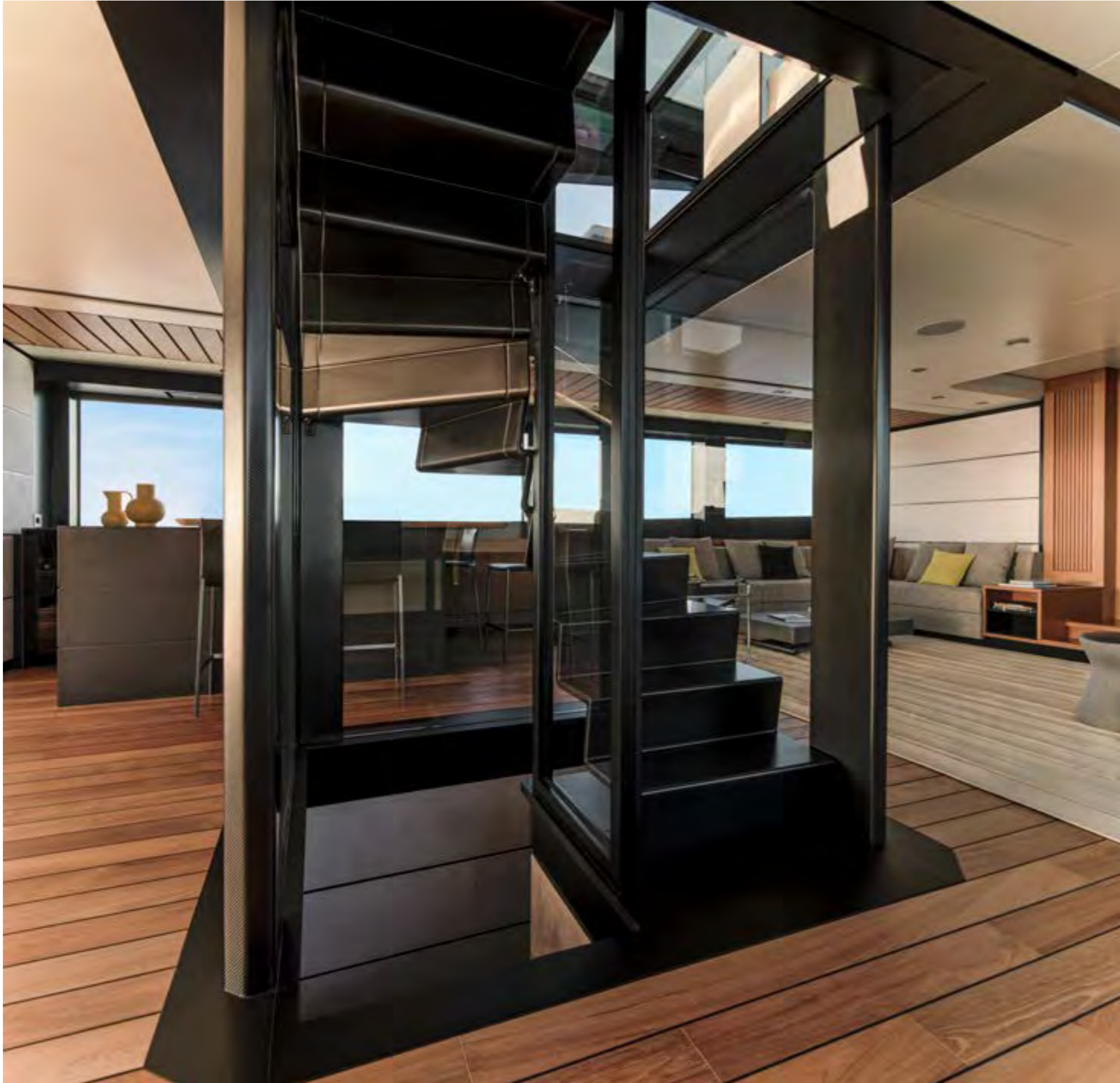
The spectacular one-piece laminated carbon staircase connects the three decks and makes bulkheads superfluous in the huge 50 sqm (538 sqft) open plan living area.