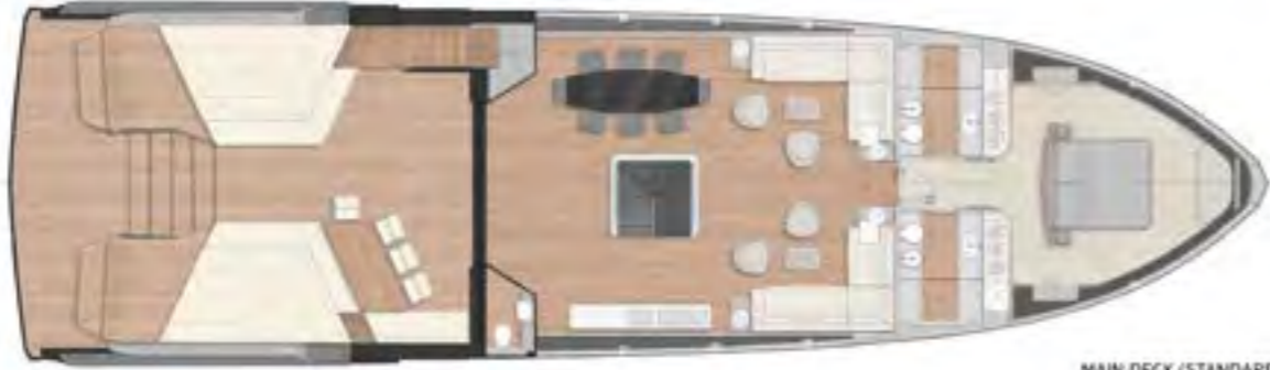
MAIN DECK (STANDARD)