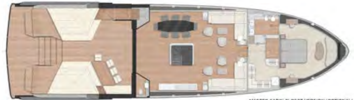
MASTER CABIN CLOSET VERSION (OPTIONAL)