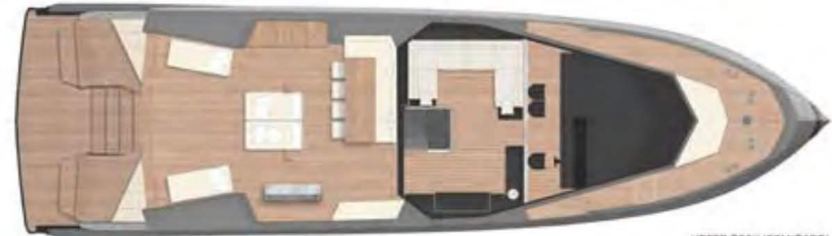
UPPER DECK (STANDARD)