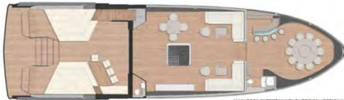
MAIN DECK ENTERTAINMENT VERSION (OPTIONAL)