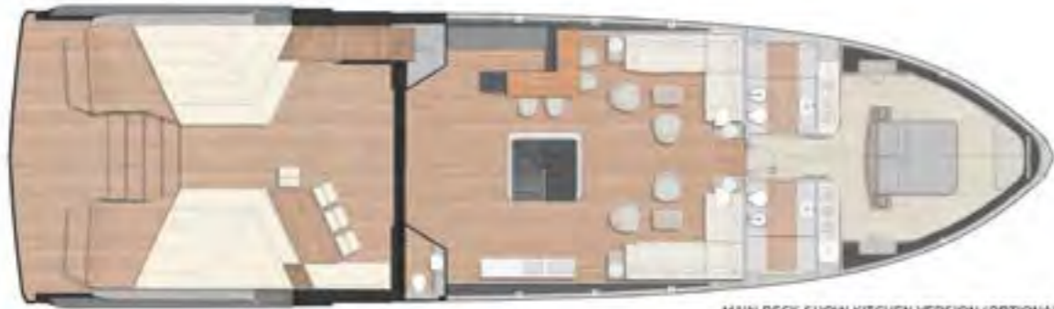
MAIN DECK SHOW KITCHEN VERSION (OPTIONAL)